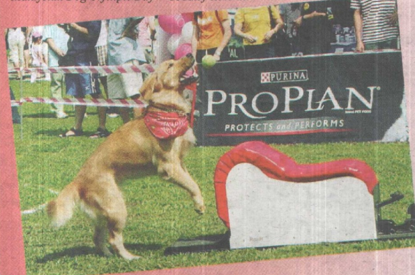
The Malaysian Dog Olympic Day is held annually outside I-Utama Shopping Complex in Petaling Jaya.

Malaysian Dog Olympic Day - Usually held at