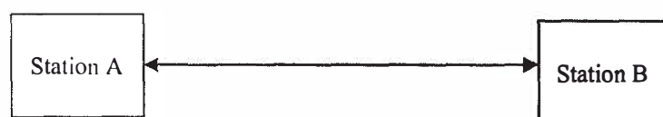
Figure 1.2: Half Duplex transmission between port A and port B

In half-duplex transmission method, both participants take turns to transmit and receive data [6-9]. It is like a one-lane bridge where two-way traffic must give way in order to cross as depicted by Figure 1.2. When transmitter at one end is transmitting, transmitter at the other end is idle. This type of transmission is frequently used for transmissions over long distances, through commutated lines and modems. In some aspects, internet surfing could be an example of half-duplex, as a user issues a request for a web document, then that document is downloaded and displayed, before the user issues another request. Another example is the operation of walkie-talkie. After one person finished talking, he will say “over” to give way to the other person to talk. This is because at one time, only one person can talk.