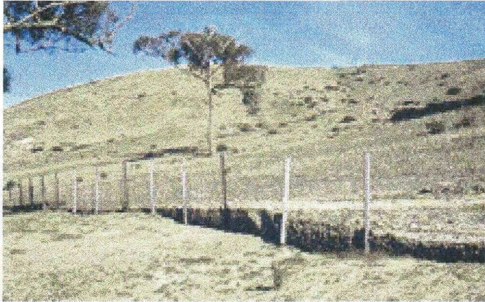
Figure 2.2 : Sedimentation of Soil along fence line seen as indication of sheet erosion