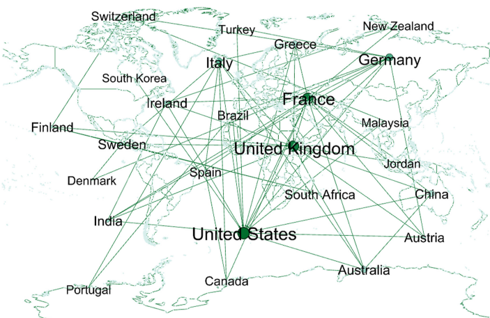
Figure 1. Collaborations in IJR&DM between 2015 and 2023