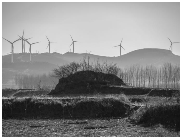
Figure 4: Monument 2 (Li, 2017)

Although the spirit of photography here is no longer enshrined in people's hearts as in the past, thinking about taking a picture without any composition problems in the most appropriate position, everything seems so reasonable. But today's photography can produce both a lot of "digital junk" and, more likely, timeless classics. Using the example of non-visual arts, we cannot assume that the decline of the record industry will cause the depression of the music industry, let alone that a more advanced technology affects art, and people also want to use artistic means to express science and technology. People should not stifle their artistic needs in a high-level artistic atmosphere. Visual culture has brought art to the public and entered the homes of ordinary people, so we should not set the threshold high.