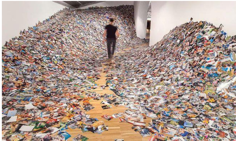
Figure 2: 24hrs in Photos (Erik, 2011 )

The photographer is free to choose and decide the final result, which is full of magic. And his position is harder to define than the photographs he takes - or, more precisely, the photographs he helps to take. Van Lier (2016) They may take the scenery that does not look good, the composition that is considered to be meaningful or the right focus or some images that do not reach the safety shutter, or even the same meaningless continuous shooting. Visual impact has become a false proposition, prompting the public to create a fake atmosphere in order to imitate famous artists or make extensive use of photography's not so deep technical means.