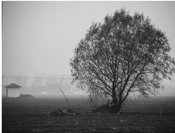
Figure 3: Monument 1 (Li, 2017)