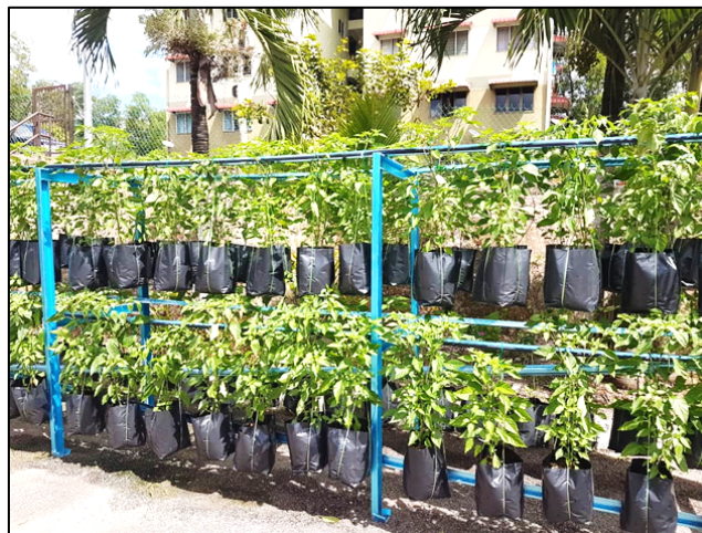
Fig. 1. 'Fertigation box' installed at Kuala Pilah, Negeri Sembilan for 250 polybags of bird's eye chili plants

Other than providing food to the community, urban farming may aid in increasing household income, employment and market opportunities, whilst optimizing human capital and energy. In Malaysia, urban farming like hydroponics, fertigation and vertical farming systems are relatively new and these systems used inorganic fertilizers or locally known as AB mix nutrients since organic fertilizers are not suitable. Figure 1 shows one of innovation in fertigation system by Agro Plantations Sdn. Bhd. called 'fertigation box' for the use of urban community. This lightweight, economical, portable and small in size system does not require huge space to setup and the maximum of 250 plants can be planted using the fertigation box.