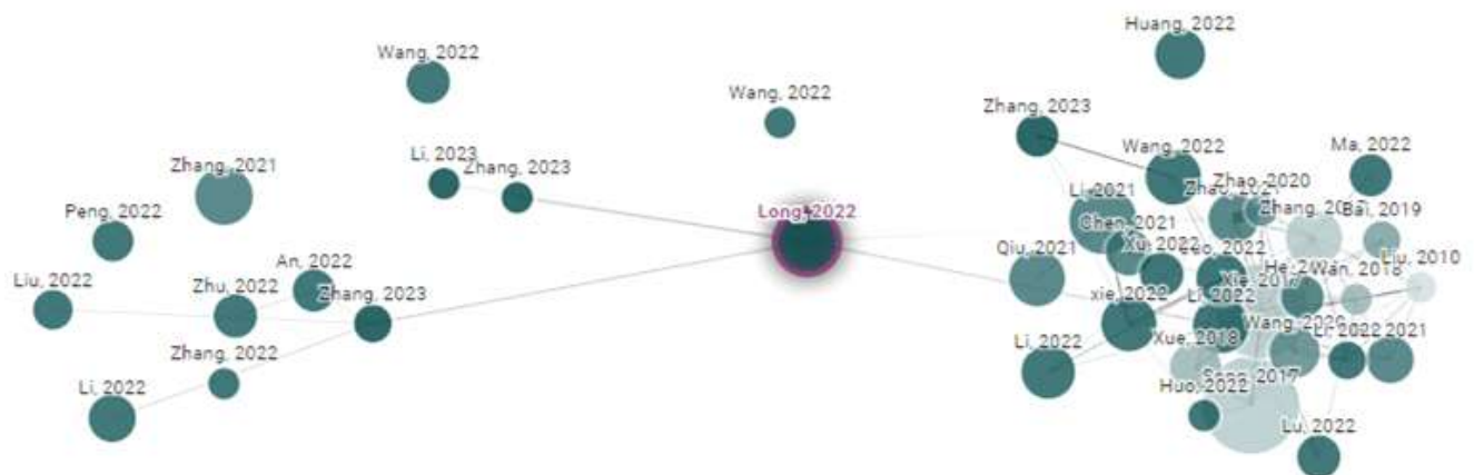
Figure 2.0: Wetland Ecosystem Service Value Related studies