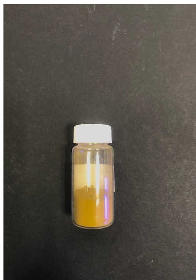
FIGURE 2. Orthosiphon aristatus powder was packaged individually in a capped bottle before exposure to cobalt-60 gamma irradiation