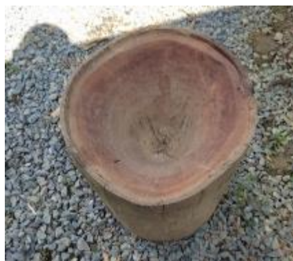
Figure 3. Lesung hindik

" lesung hindik " (Figure 3). Traditionally, two or three people are needed during the flattened process to pound and smash the " lesung hindik " until the glutinous paddy turn a flattened shape, and the husks are removed. After the flattened process, the glutinous paddy was put into " nyiru buluh " (Figure 4) to remove and separate the husk from the glutinous rice flake during the sieving process. The glutinous rice is heavier than the husk, so the husk will be separated easily. After separating the husk, glutinous rice flake is ready to eat and looks like oatmeal flakes.