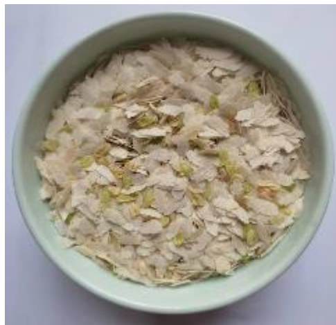
Figure 2. Glutinous Rice flake

The study conducted by Dahare et al. (2019) stated that rice flake basically undergoes a traditional cooking method. The first step is we need to cut the half-ripe paddy stalk. The paddy stalks are cut and then tied in a bundle. The bundle of glutinous paddy consists of paddy that is green or yellow. Then, the selected paddy is separated from the paddy stalks by hand. Another study by Amrinola et al. (2022) stated that glutinous rice flake is made from glutinous paddy grain pre-roasted and then flattened. The separated grains will be put into a wok and dried without any oil for a particular time until the popping sound is produced. Then, the cooked glutinous paddy was immediately flattened using a wooden pestle and mortar or