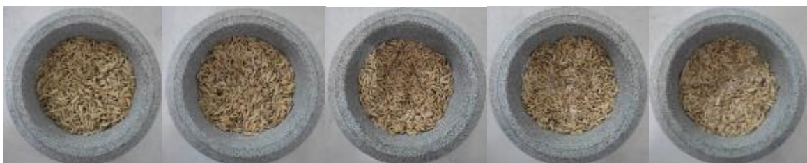
Figure 8. (a) 3.3 min; (b) 4.0 min; (c) 4.3 min; (d) 5.0 min; (e) 5.3 min.