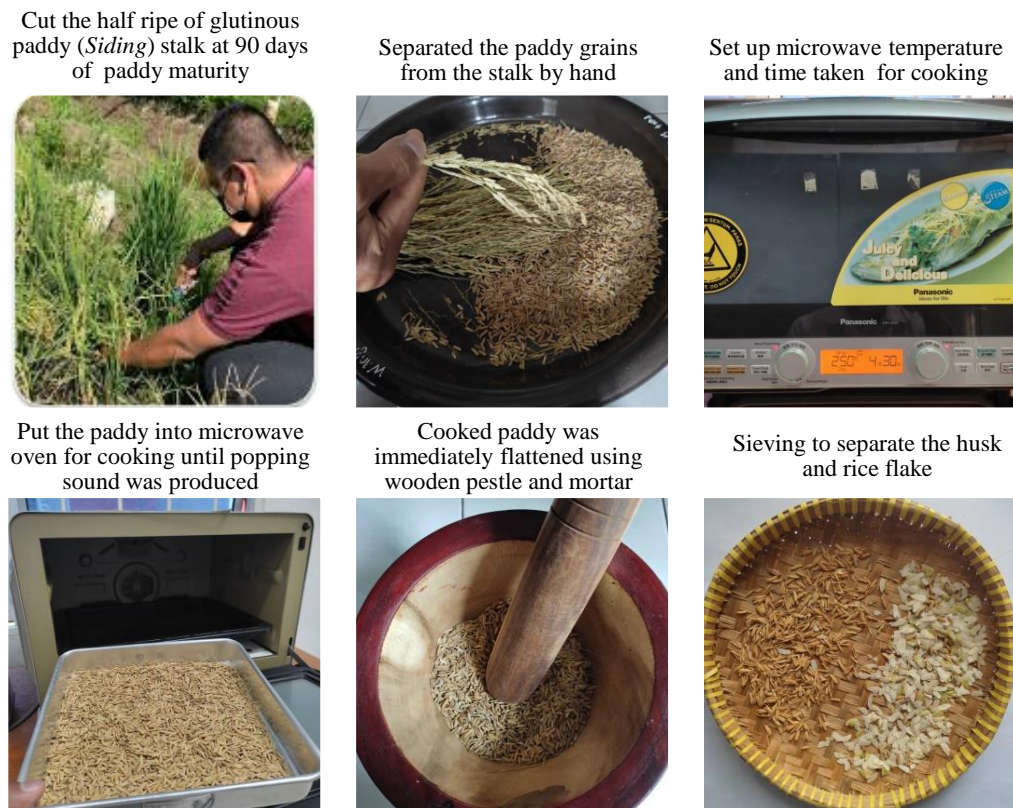
Figure 6. Steps of cooking glutinous rice flake by using a microwave oven