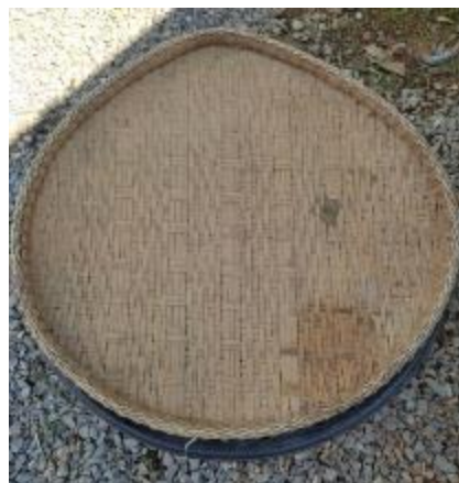
Figure 4. Nyiru buluh

On the other hand, the disposal of by-products leads to a loss in potential revenues and a rise in the disposal cost of these products (Jayathilakan et al. , 2012). During the paddy harvesting season, the immature paddy is not selected for rice processing since the paddy grain is not entirely and will be disposed of. Instead of disposing of it, farmers can use the immature paddy grain to process and produce a cereal-like rice flake.