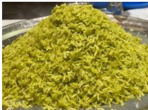
Figure 1. Ringgi

Glutinous paddy, also known as Oryza sativa var. glutinosa , is a bowl of cultivated rice with long-standing cultural values in Asia. Glutinous paddy has a characteristic such as being waxy, opaque, and sticky, and the size of the grain cultivar is small compared with other paddy cultivar (Zainal & Shamsudin, 2021). There are several types of glutinous paddy in Malaysia, such as Susu , Siding and Gantung Alu . It is also an essential cereal grain and a staple food in many parts of the world (Stanley, n.d.).