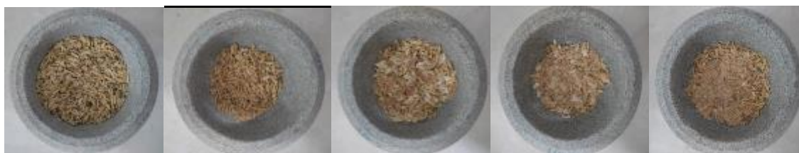
Figure 9. (a) 3.3 min; (b) 4.0 min; (c) 4.3 min; (d) 5.0 min; (e) 5.3 min.