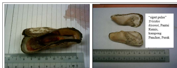
Figure 2: The Trisidos kiyonoi bought from Kampung Panchor, Pantai Remis, Perak