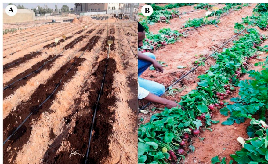
Fig. 1. Experimental site and layout (A) and harvest of 'Crimson Giant' red radish (B).

T max and T min = maximum and minimum air temperature; RH max and RH min = maximum and minimum air relative humidity; solar LY = Langley; WS = wind speed; ET 0 = reference evapotranspiration.