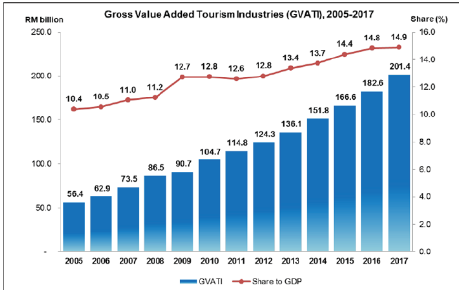
Figure 1.1 : Annual revenue from tourism sector and share to Malaysia’s GDP

The hotel industry is one of the most important sectors for the reception and attraction of tourists in Malaysia (Hassan, Pourabedin, Sade & Chai, 2018; Teo, Bernhard & Chee, 2017). The expected development and contribution of the tourism industry to the general economy of the country have opened opportunities for the expansion of the hotel sector (Azureen, Rahman & Nordin, 2018; Yadegaridehkordi, Nilashi, Nasir & Ibrahim, 2018). It is a major contributor to the tourism industry, accounting for 12.8% of the total tourism contribution to Malaysia's GDP, valued at $20.7 billion (inbound) in 2017 (Department of Statistics Malaysia, 2018). The contribution of the hotel sector to the economic and social development of modern Malaysia cannot be overlooked. According to Tourism Malaysia (2019), there were 4,750 hotels registered in Malaysia with ratings from 1 to 5 stars in 2018. This shows an increase in the number of hotels of 53.5% since 2013 (Yadegaridehkordi et al., 2018).