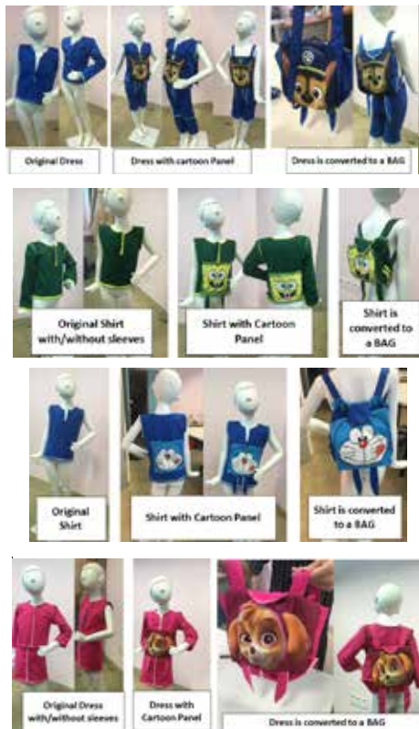
Figure 2: Four sustainable children's clothes with multifunction ability