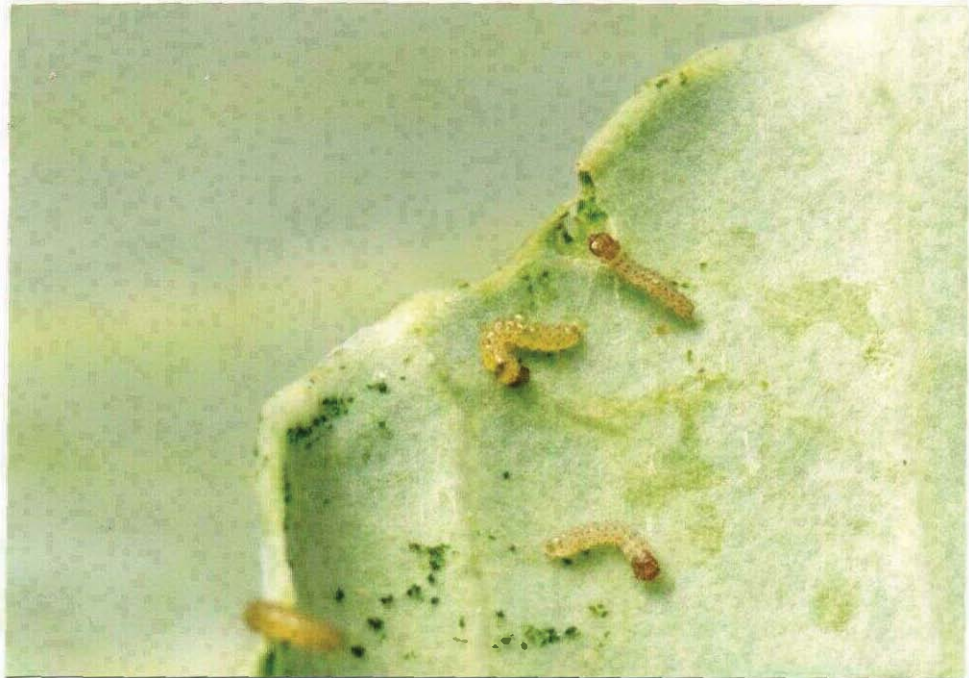
Plate 2 : First instar larvae of C. binotalis are slender and the body is greenish yellow in colour (about 2 mm).