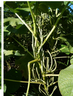
Figure 8. Piper umbellatum stem and inflorescence