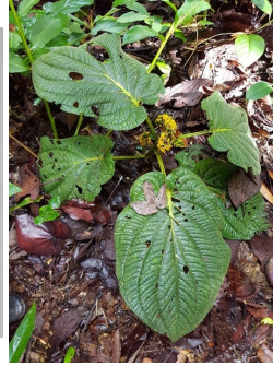
Figure 3. Piper borneense var. 2. growth in a single stem