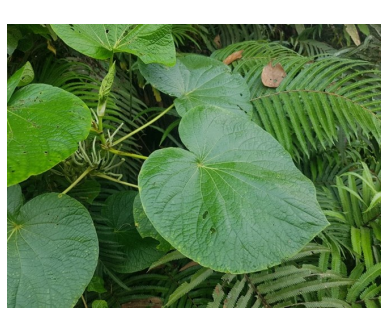
Figure 7. Piper umbellatum growing on black soil