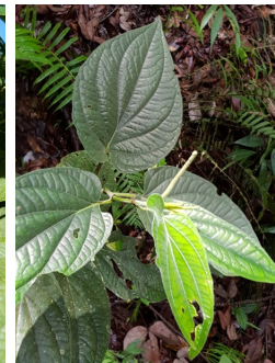
Figure 9. Piper auritifolium growing on high organic soils