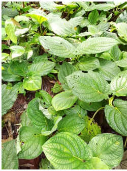
Figure 1. Growth habits of Piper borneense var. 1. on riverine area with big clump