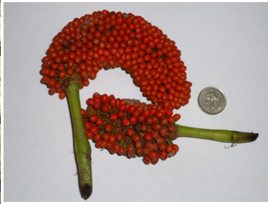
Figure 2. Piper borneense var. 1 inflorescences always red in colour