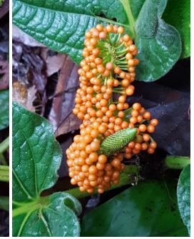
Figure 5. Piper borneense var. 3. growing on rock crevices