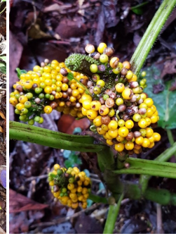
Figure 4. Piper borneense var. 2 inflorescences in yellowish-green