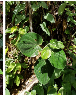
Figure 10. Piper rueckeri growing on steep slope