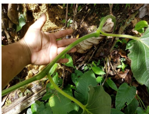
Figure 11. Piper rueckeri stem