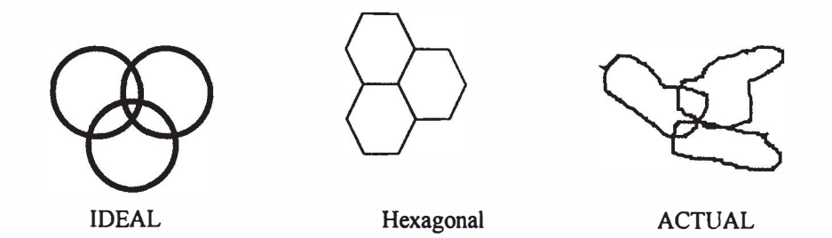
Figure 1.1: Different Cell Structures

reusing the same frequency in different geographical areas known as cells. The shape of a cell must be such that, the cells interlocking obtain the total coverage. Theoretically, the shape of the cell is hexagonal and this shape is assumed for planning and representation of cells on paper in order to simplify the situation when covering a specific area. But the actual cell shape is dependent on the topology of the geographical area itself and the radiation pattern of the transmitter's antenna (Yacoub, 1993). The different cell structures are shown in Figure 1.1. Each site services subscriber stations within a limited geographical area. When a subscriber moves between cells, over the air messaging is used to transfer control from the old cell to the new cell. This transfer of control is termed hand-off or hand-over.