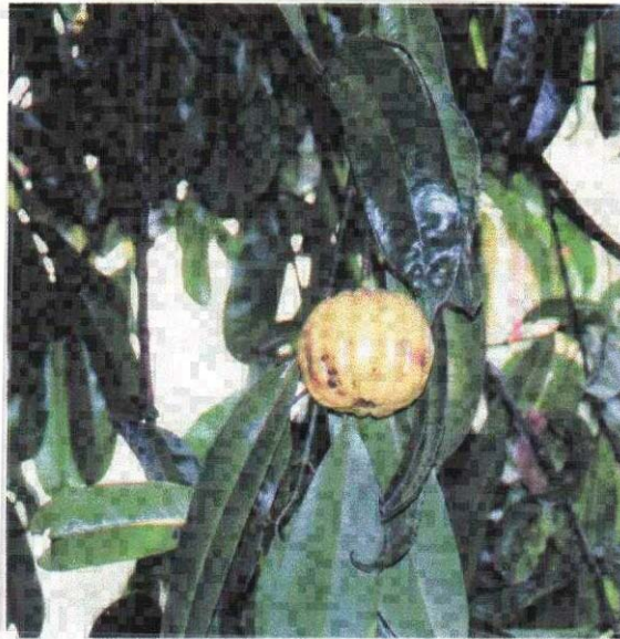
Plate 2: Leaves and a Fruit of G. atroviridis