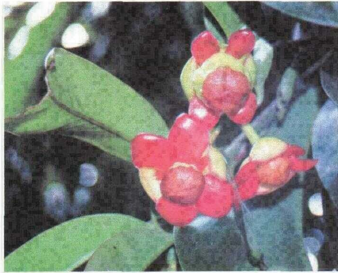
Plate 3: Flowers of G. atroviridis