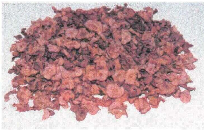
Plate 5: 'Asam Keping'