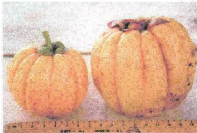
Plate 4: Fresh Fruits of G. atroviridis