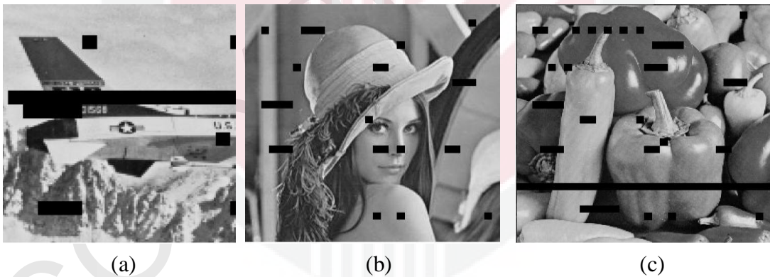
Figure 1.1 The received wireless images: (a) Jet (512 x 512 pixels); (b) Lena (512 x 512 pixels), and (c) Peppers (512 x 512 pixels) .

Even the loss of one bit that happen during the transmission of a digital image will lead to the loss of a vital information in an image. The corrupted transmitted image will be facing a further degradation when it undergoes a bit-stream compression process using VLC [1]. Figure 1.1 presents some examples of corrupted images received from wireless channels [2]. As shown in the figure, these images suffer from several damaged patches that reduced the quality of the images.