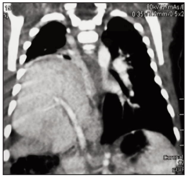
Figure 2: Contrast enhanced computed tomography of the thorax (CECT thorax) showed presence of liver parenchyma in the right thoracic cavity predominantly at the posterior aspect with intact anterior and posterior hemidiaphragm.

The subsequent ultrasonographic study disclosed the presence of liver parenchyma in the right thoracic cavity predominantly at the posterior aspect with intact anterior and posterior right hemidiaphragm suggestive of focal eventration. These findings were supported by a contrast enhanced computed tomography of the thorax (Figure 2). He made a tremendous recovery following diaphragmatic plication and was successfully weaned off oxygen 4 days post-operatively. He continued to do well on follow up.