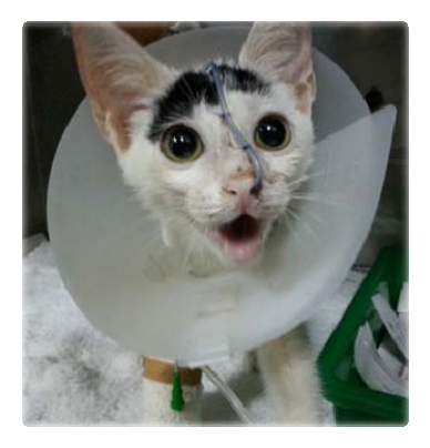
Figure 1. Kitten managed on nasogastric tube feeding throughout hospitalisation.

The problem list included dysphagia, regurgitation and emaciation with the differential diagnoses of; esophageal foreign body, oesophagitis, oesophageal stricture; and bilateral nasal discharge due to feline upper respiratory disease (FURD).Intravenous fluid therapy (Lactated Ringer's) was administered upon hospitalisation to rehydrate the kitten and Dulphalyte (Cymedica, Czech Republic) was added as supportive therapy. Thoracic and abdominal radiographs revealed normal appearance of the gastrointestinal structure with no no obvious or visible obstruction due to foreign body, thus esophageal foreign body was unlikely in this case. The kitten was maintained on a nasogastric feeding tube to ensure adequate caloric intake and to reduce the episodes of regurgitation during hospitalisation (Figure 1).