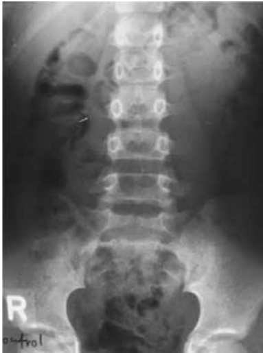
Fig.2: There is a small faint opacity seen in the course of the right upper ureter representing a stone (arrowed)