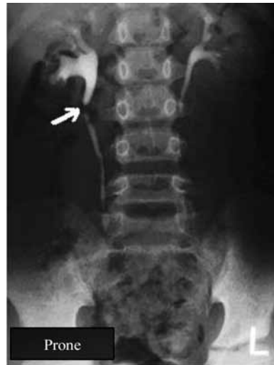
Fig.3: IVU – 15-minute AP film; there is mild right sided hydronephrosis and proximal right hydroureter with a filling defect seen in the right upper ureter (arrowed)

favouring partial right upper ureteric stone obstruction, as shown in Fig.2 and Fig.3. The stone was removed following a flexible ureteroscopic procedure. This report highlights the value of a combined US and a limited series of IVU in children with acute abdominal pain for which the incidence of urolithiasis is escalating among those who reside in the tropics.