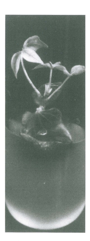
Fig. 3: A single isolated shoot