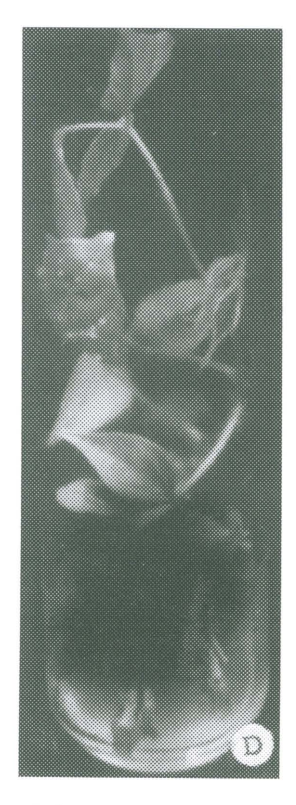
Fig. 4: Root induction of from regenated shoots