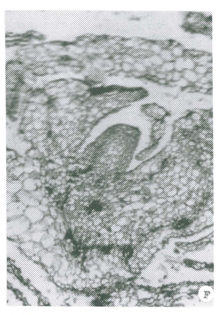
Fig. 6: Histological section showing the development of shoot primordia from the leaf callus

unguiculata (L) walp). Israel J. Pl. Sci. 43 : 385-390.