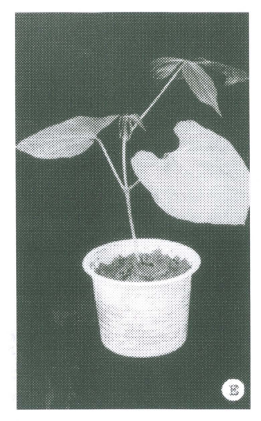
Fig. 5: A hardened plant (after 3 weeks of transfer to plastic cups)

effect). Finally, these plants were successfully transferred to the field ( Fig. 5 ). The regeneration of shoot primordia from the leaf callus were histologically analysed confirming indirect regeneration ( Fig. 6 ).