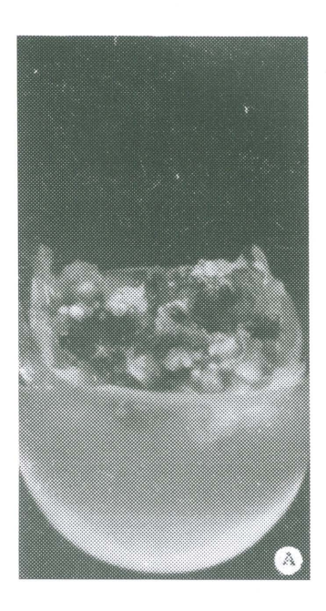
Fig. 1: A greenish compact nodular callus from leaf explant