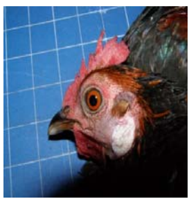
Figure 3. Eclipse plumage demonstrated by an adult male Red Junglefowl

plumage (Figure 3). These results were in accordance to the previous studies reported from several authors (Johnsgard, 1999; Madge, and McGowan. 2002; Babjee 2009). From all the birds that were captured and