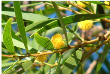
Figure 5: Yellow acasia.

2.1.4. Broad-leaved Acacia ( Acacia mangium ). Another popular Acacia species that has made its entry into our Malaysian landscape is the Acacia mangium or locally called Broad-leaved Acacia ( Akasia Daun Lebar ). This handsome tree with light green, broad leaves and conical shaped was introduced as timber trees in plantations for the pulp and paper industry in Sabah in 1966. The tree is native to Queensland, Australia as well as Papua New Guinea, Irian Jaya and in some parts of Indonesia. Today, Broad-leaved Acacia is still planted in parks but its use as street trees has been discouraged because of brittle branches. The threat from this species is that it is found growing wild almost in any open space in cities, rural areas as well as on the fringes of forests. Some even have found their way into national parks and other conservation areas.