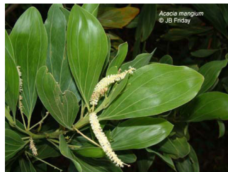
Figure 6. Broad-leaves acasia.

2.1.4. Broad-leaved Acacia ( Acacia mangium ). Another popular Acacia species that has made its entry into our Malaysian landscape is the Acacia mangium or locally called Broad-leaved Acacia ( Akasia Daun Lebar ). This handsome tree with light green, broad leaves and conical shaped was introduced as timber trees in plantations for the pulp and paper industry in Sabah in 1966. The tree is native to Queensland, Australia as well as Papua New Guinea, Irian Jaya and in some parts of Indonesia. Today, Broad-leaved Acacia is still planted in parks but its use as street trees has been discouraged because of brittle branches. The threat from this species is that it is found growing wild almost in any open space in cities, rural areas as well as on the fringes of forests. Some even have found their way into national parks and other conservation areas.