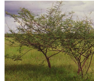
Figure 1: Elephant thorn.

2.1.1. Elephant Thorn ( Mimosa pigra ). Elephant Thorns or Duri Gajah is fast becoming a major problem in the landscape not only in Malaysia but also in many other tropical countries. The plant originated from tropical South America but was brought to other parts of the world as green manure and cover crops. It first entered Thailand in 1947 and made its way to Malaysia soon after that. Today, it has spread south as far as Indonesia and Australia causing serious problems to human and animals. They can be seen to sprout out of unlikely places such as TNB’s utility substations, around campuses, along riverbanks and lakes and ponds.