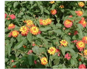
Figure 7. Lantana.

However, once escaped into the wild, Lantana can grow as a tall shrub and formed a dense thicket up to 5.0 meters high in open ground. The shrub can also grow as a scrambling plant under the shade of taller trees. Once they found their way into the open ground they will quickly smother other plants.