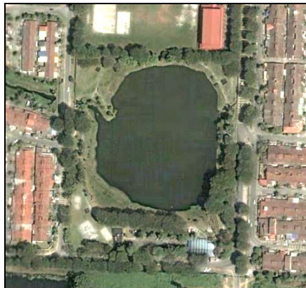
Figure 3: Recreational lake aerial view before infestation.

2.1.3. Yellow Acacia ( Acacia auriculaeformis ). This fast growing tree was a popular roadside tree planted in the Malaysian landscape during the 70's and 80's together with two other Acacia species – the A. cincinnata (Silver Wattle) and A. mangium (Broadleaved Acacia). They originated from Australia, New Guinea and parts of Indonesia. Known locally as Yellow Acacia or Akasia Kuning , this tree was planted all over Asia in plantations for pulp and paper as well as soft timber. It is also popular for afforestation and landscaping. Boland (1990) reported that the tree was used for landscaping purposes in Thailand in 1935 and India in 1946. Yellow Acacia's popularity is probably due to its ability to grow easily on infertile urban soils as well as on soils that has been disturbed such as on ex-mining land. Today, this tree is no longer a popular roadside tree in Malaysia but nevertheless it is found to be growing wild and out of control in many open spaces in Malaysian cities.