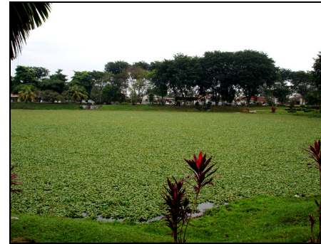
Figure 4: Recreational lake infested with Eichornia crassipes within a few weeks.