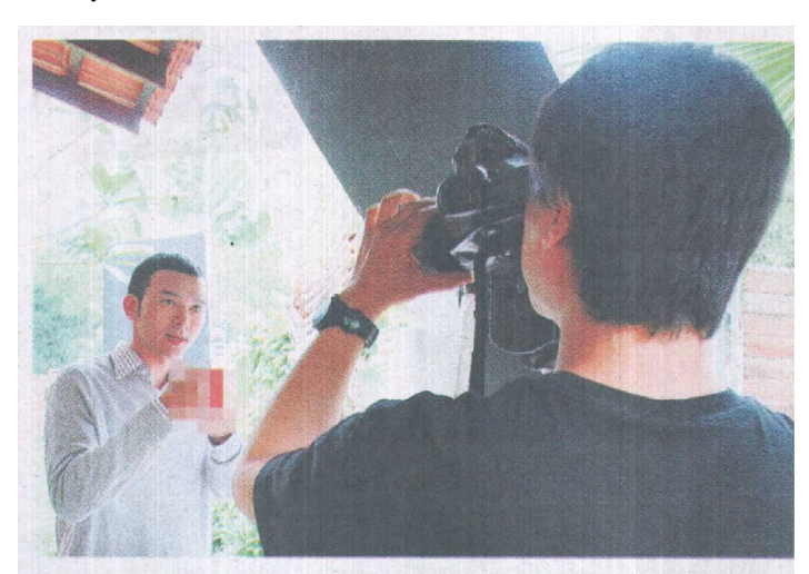
An exclusive peek at the upcoming print campaign starring Yap.