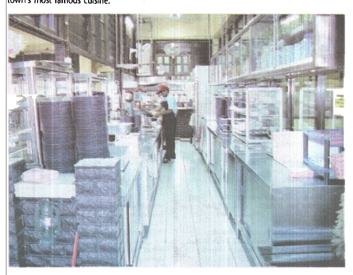
A uniformed kitchen helper preparing a dish for eager customers