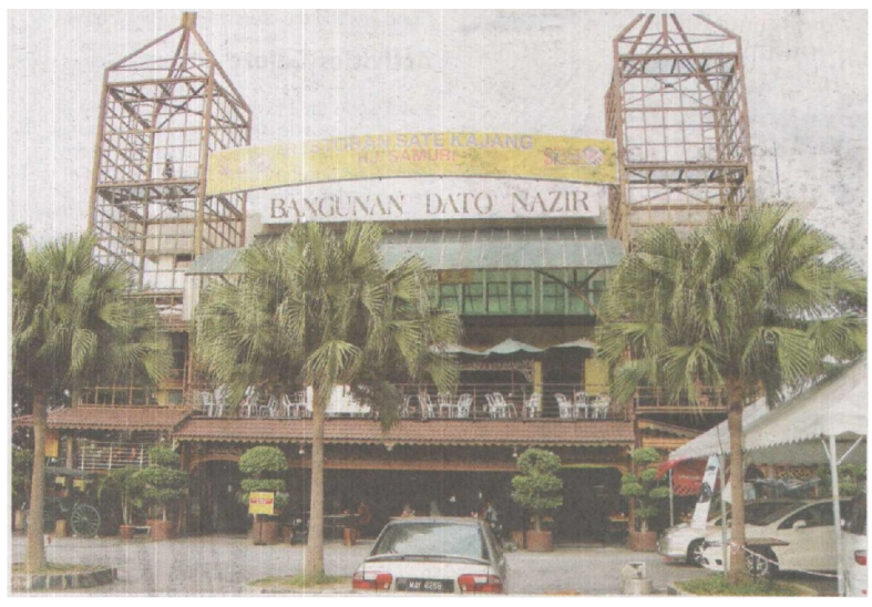
Kajang's famous Haji Samuri Satay Restaurant

Kajang is a town that is talked about but seldom visited by foodies because its famous product has spread to other towns. PHILIP LIM makes an impromptu visit to uncover its other secrets