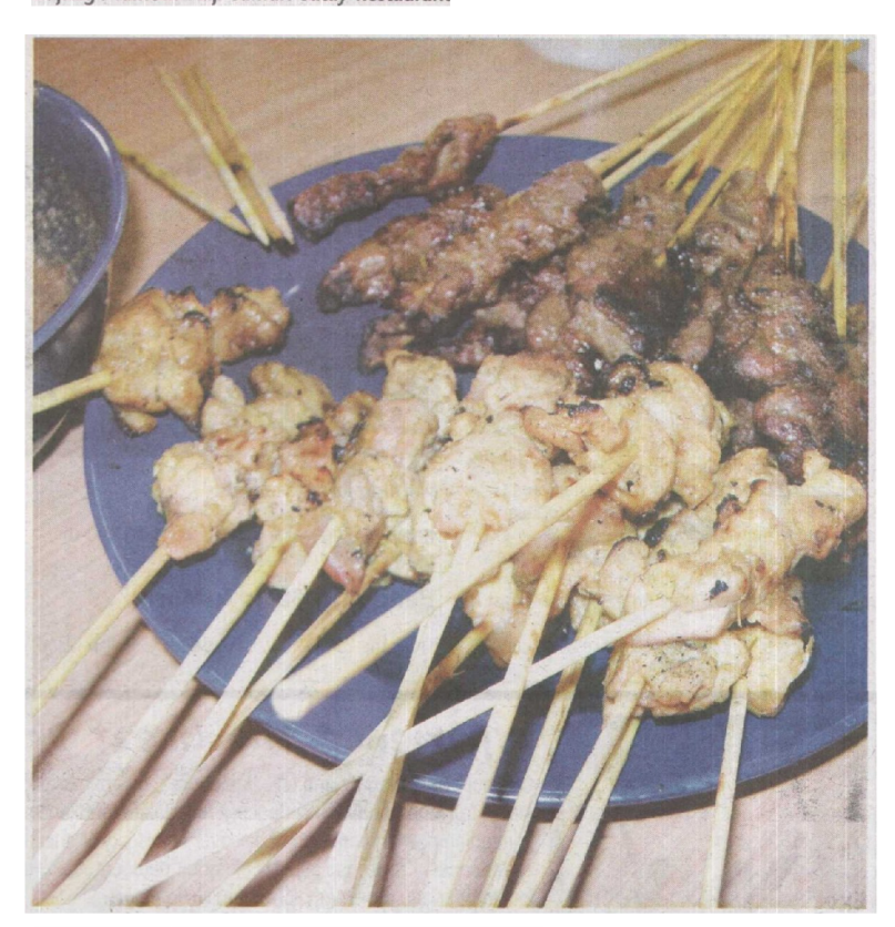
Sticks of beef and chicken satay fresh from the kitchen